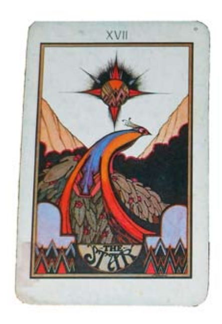
Cards from the Aquarian tarot deck

While visualizing the Soap Plant that morning, I drew a tarot card which turned out to be the Queen of Pentacles; the lower arcana physical image of the Empress: "...the feminine expression of Mother Earth herself.... In her most practical mode she can become completely absorbed by the physical concerns of the earth plane, thereby limiting her imagination and scope."