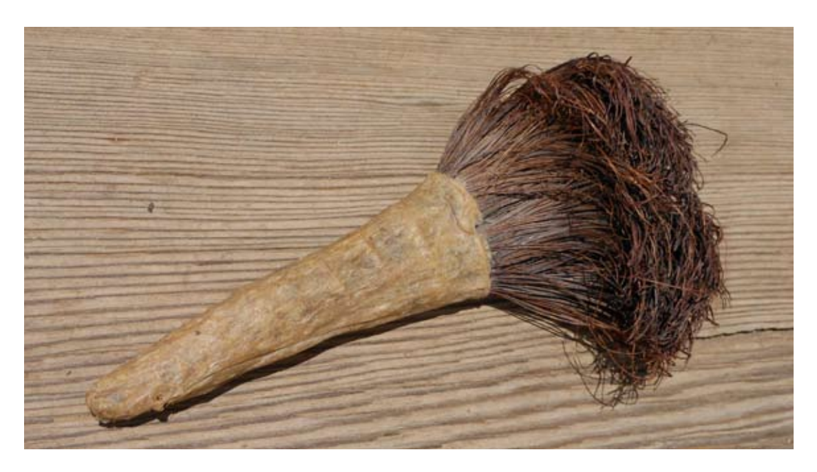
The "soaproot" brush that my daughter made

In addition, it was reported that the leaves were eaten when still young and fresh. The older leaves were used for wrapping acorn bread during baking.